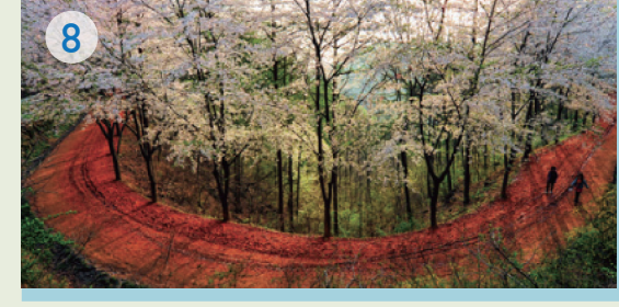
Hwangtot-gil (red-clay path) of Mt. Gyejok 계족산 황톳길

Lake Daecheong is a clear lake in narmony with its surrounding mountain