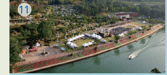
Ppuri Park 뿌리공원

12 courses of path offer the most healthy mountain-hiking experience for visitors.